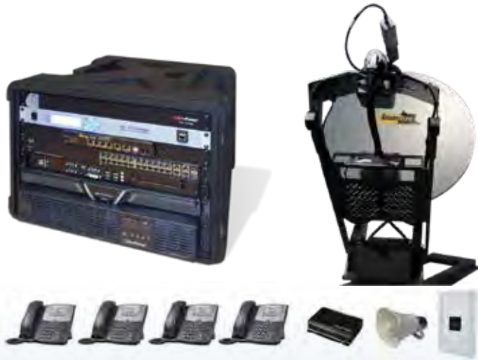
Squire Tech Solutions MR 600 equipment shown above.

Equipment Packages and Service Plans offer low satellite latency, high quality audio and video for live mobile response applications. Our small antennas fit easily on pCom® Response Trailer, Command Center, SUV or can easily be added to an existing trailer or vehicle. Automated hardware operation and bandwidth access free up valuable time to focus on other vital response tasks.